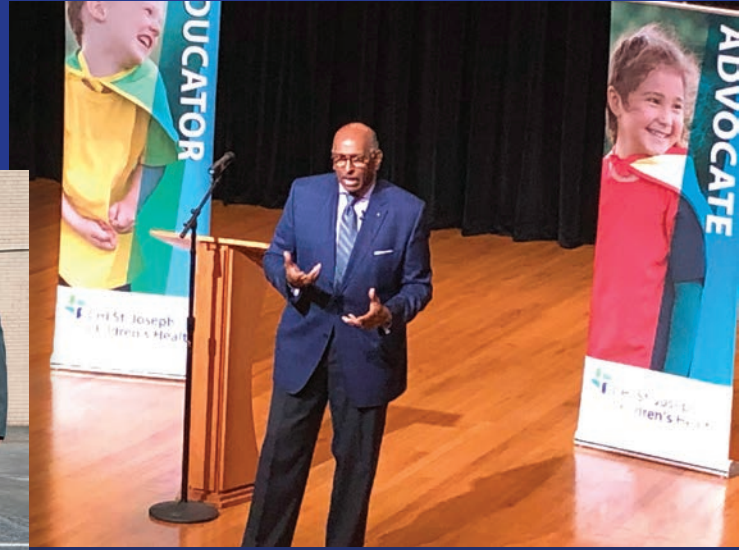
Top Right: An Evening with Michael Steele Event at The Ware Center; Top Left: Groundbreaking event of the new St. John Neumann School; Lower Right: Mobile Market at Taylor Middle School in partnership with Columbia Borough School District and Heritage Creek Farm Camp; Below: Our staff with Former Secretary of Housing and Urban Development, Julian Castro.